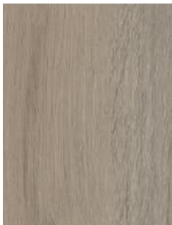
710 Silver Hardwood