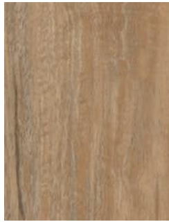
525 Silk Spotted Gum