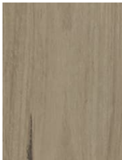
735 Stony Blackbutt