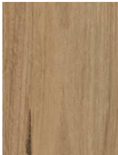
545 Classic Blackbutt