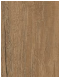
555 Bright Spotted Gum