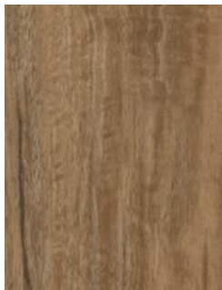
585 Brindle Spotted Gum