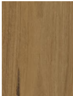
570 Tawny Blackbutt