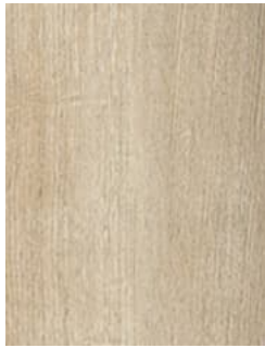
110 Pearl Oak