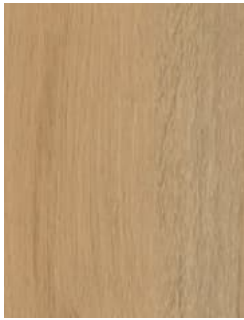
300 Tan Hardwood