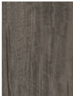
790 Iron Spotted Gum