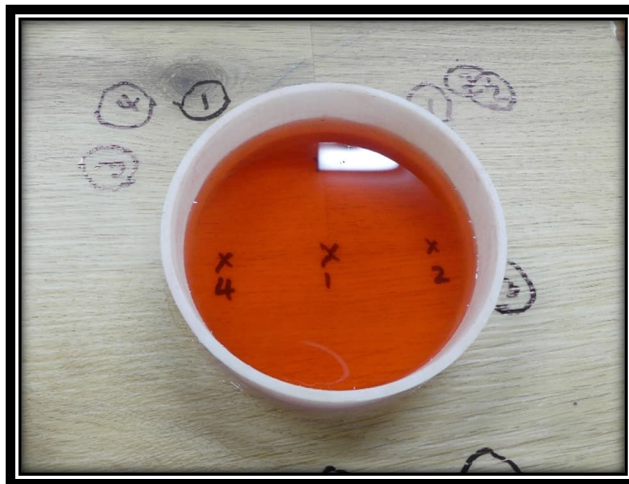
After 24 hrs With Water